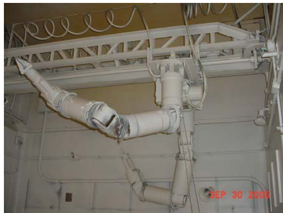
Fig. 3. Fixed equipment such as these manipulator arms.

Final decontamination efforts were primarily conducted through the utilization of hand held