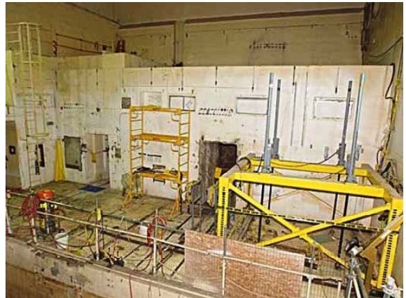
Fig. 2. Hot Cell 1 and 2 prior to Remediation Efforts.