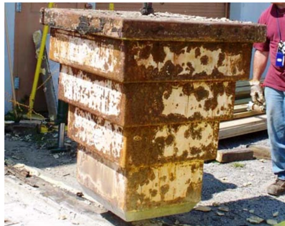
Fig. 9. Steel jacketed concrete plug from the hot pipe tunnel prior to remediation efforts.