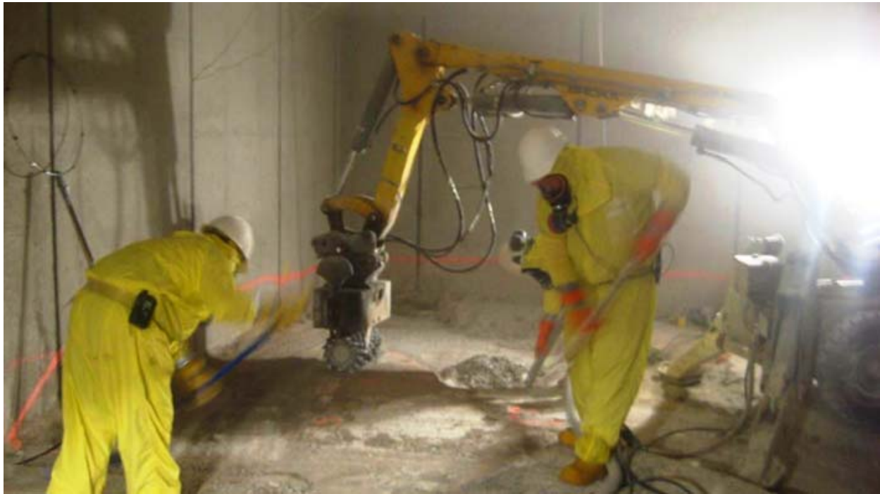
Fig. 11. Actual spot remediation efforts within the hot pipe tunnel.

Structural decontamination of the walls and ceiling of the HPT which included over 547 m 2 (5,890 ft 2 ) was completed by July 14, 2007, using the SMBS. Technicians were successful in reducing the residual contamination levels on the HPT walls and ceiling to less than 29,000 Bq/m 2 (17,500 dpm/100 cm 2 ), or one-half of the target DCGL.