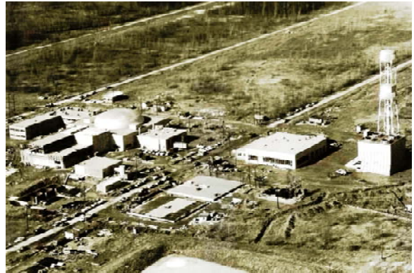
Fig. 1. NASA's Plum Brook Reactor Facility – circa 1963.

The HCs and the associated HPT were some of the most highly contaminated surfaces at PBRF. Fixed contamination levels exceeded 11.69 \text{ MBq/m}^2 ( 7,000,000 \text{ dpm}/100 \text{ cm}^2 ), while loose contamination exceeded 8.35 \text{ MBq/m}^2 ( 5,000,000 \text{ dpm}/100 \text{ cm}^2 ).