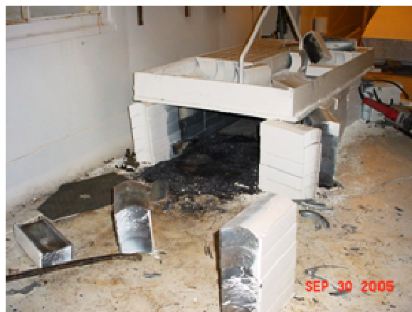
Fig. 4. Loose equipment included items like this work table.