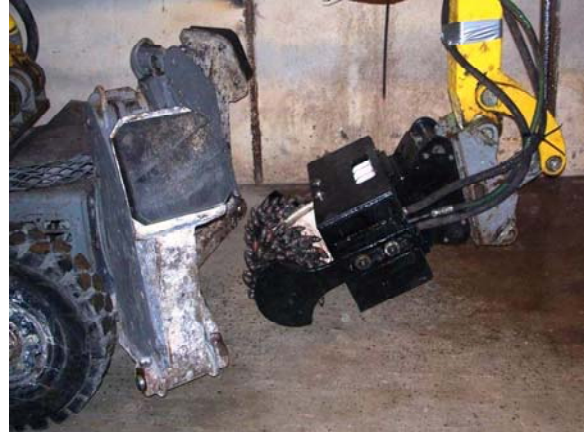
Fig. 8. Scaling drum used to remediate the floors of hot cells and the hot pipe tunnel.

Employment of these tools enabled technicians to reduce the residual contamination levels on the HC surfaces to less than 28,000 Bq/m 2 (17,000 dpm/100 cm 2 ), or one-half of the target DCGL for the HC. Moreover, decontaminating the barrier doors, roof slabs, and the barrier door receipt pockets using the same techniques facilitated the