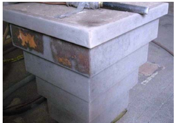
Fig. 10. Remediated plug, free released and to be used as backfill.