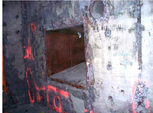
Fig. 6. Example of “Lunar Landscape” like surface resulting from initial remediation approach.

The removal of the embedded components left the surfaces of the HC in a “lunar landscape” like condition (Fig. 6). Simply put, the surfaces were so pockmarked that a conventional scabblers head would have been ineffective in removing all of the contamination located in the crevices and depressions on the HC surfaces. Hence, it was determined that the only effective means of decontaminating the HC surfaces would be to utilize remotely operated equipment to chip away at the contaminated concrete surfaces. An electrically powered demolition device was utilized as the tool carrier of choice.